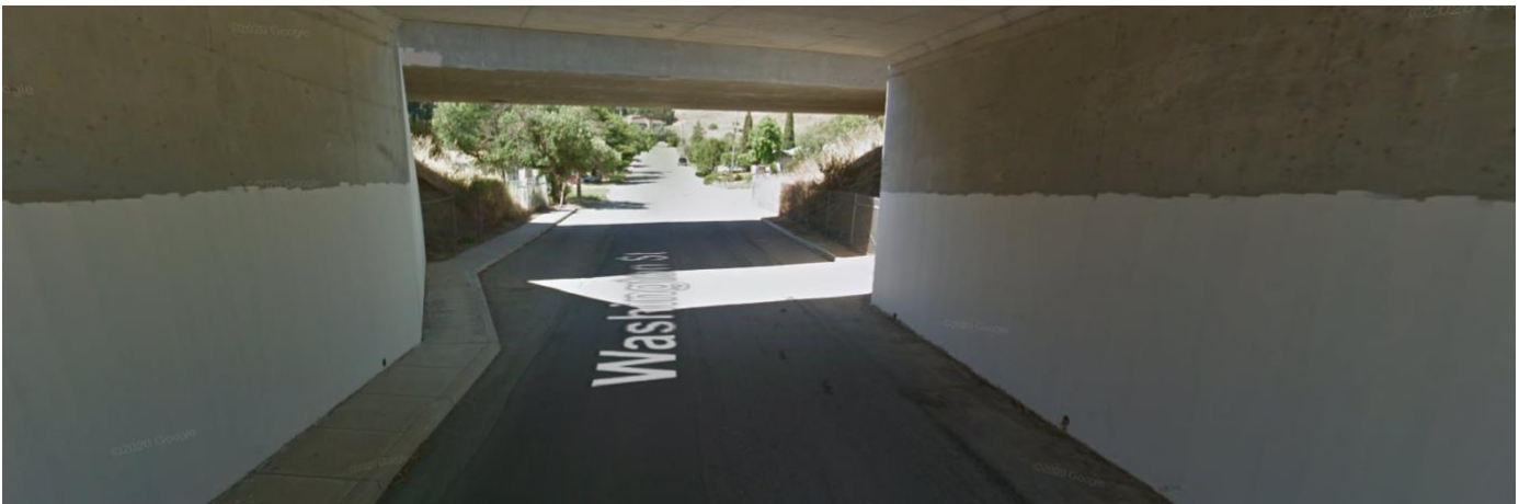
Figure 2 Washington St Underpass Inside Walls (View Looking South)