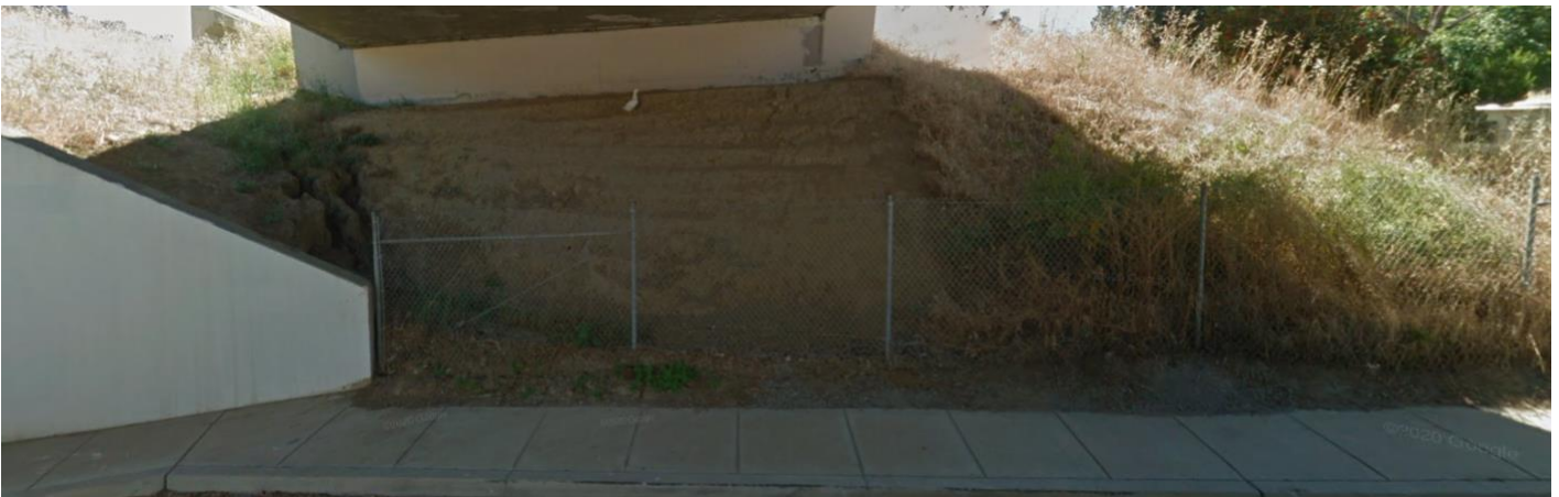
Figure 4 Planned Concrete Slope Paving Area East Side