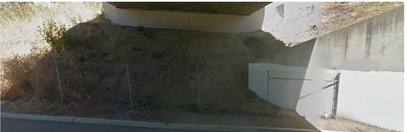
Figure 5 Planned Concrete Slope Paving Area West Side