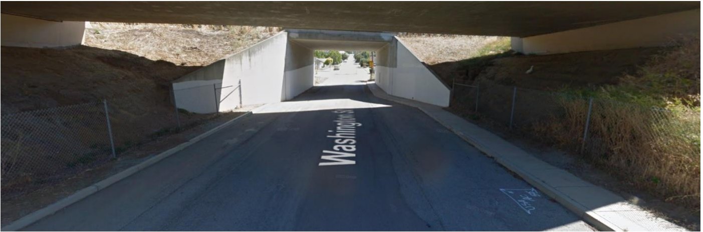
Figure 3 Washington St Underpass Inside Walls and South Façade (View Looking North)