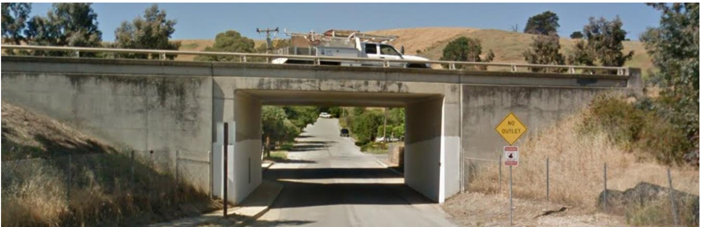
Figure 1 Washington Street Underpass North Façade (View Looking South)