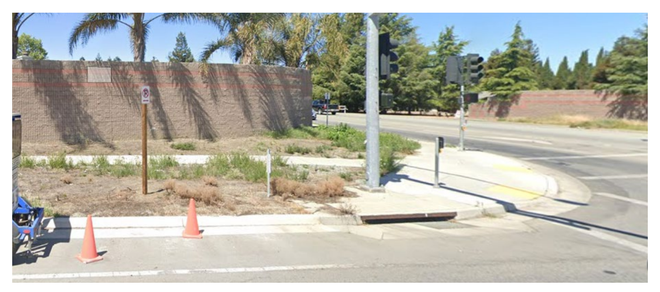
Figure 3 Corner of Santa Ana & Highway 25, facing west