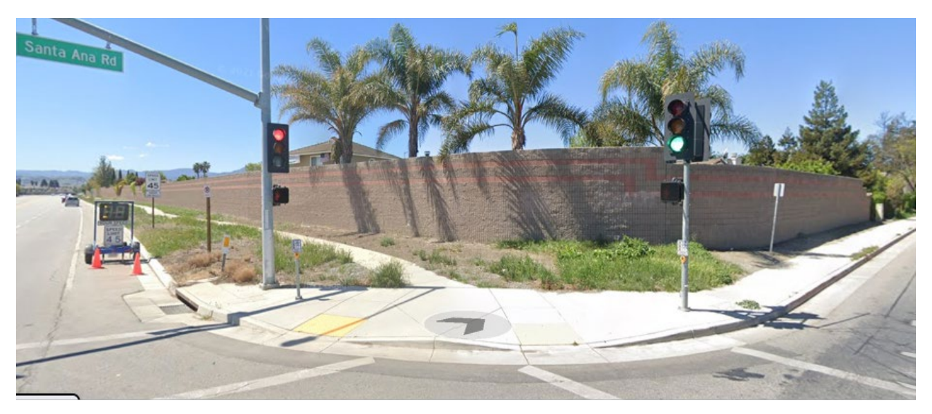
Figure 1 Corner of Santa Ana & Highway 25, facing southwest