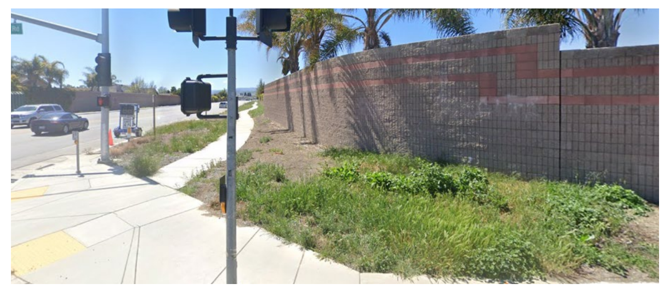
Figure 2 Corner of Santa Ana & Highway 25, facing southwest