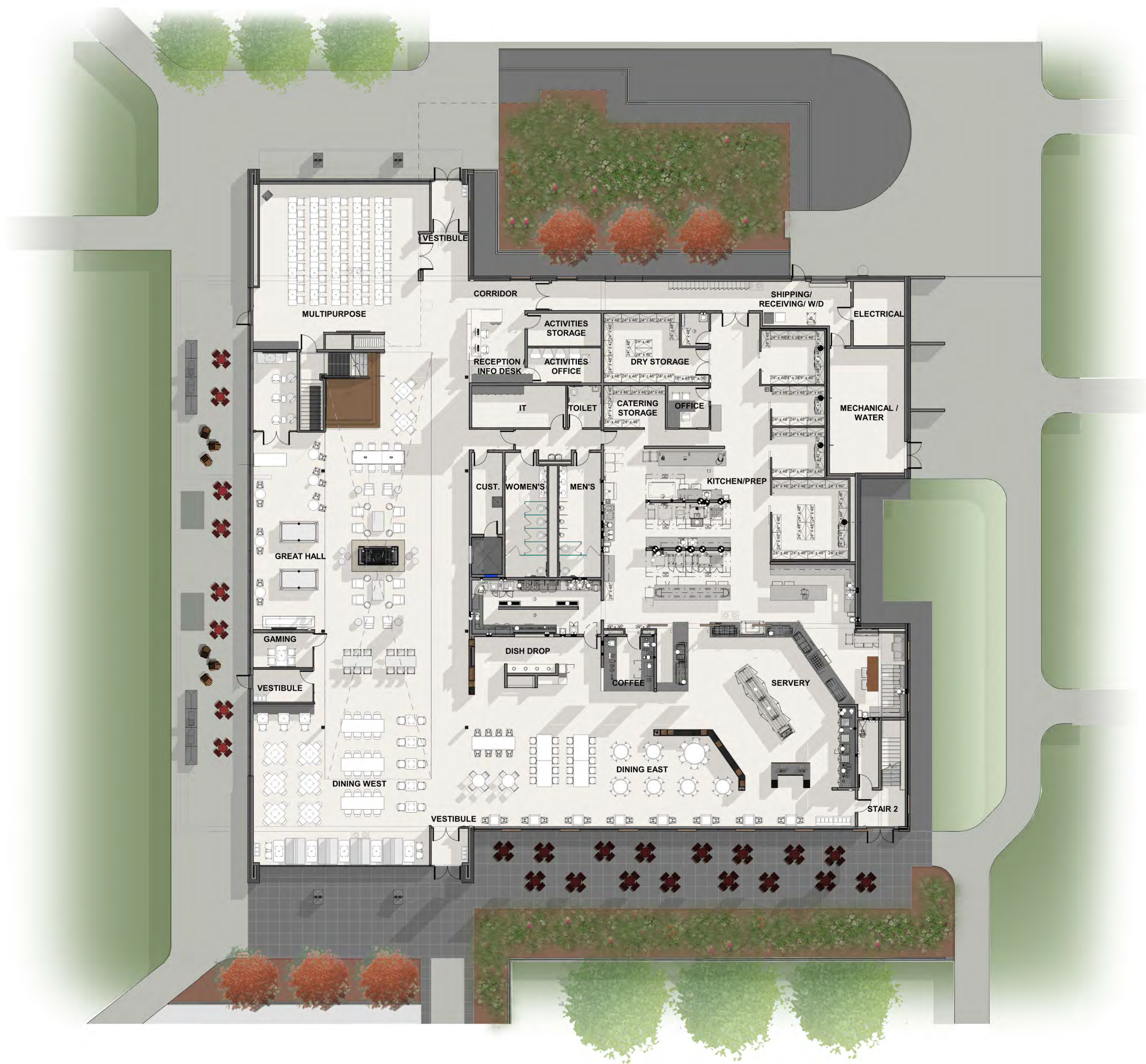
FIRST LEVEL - STUDENT CENTER