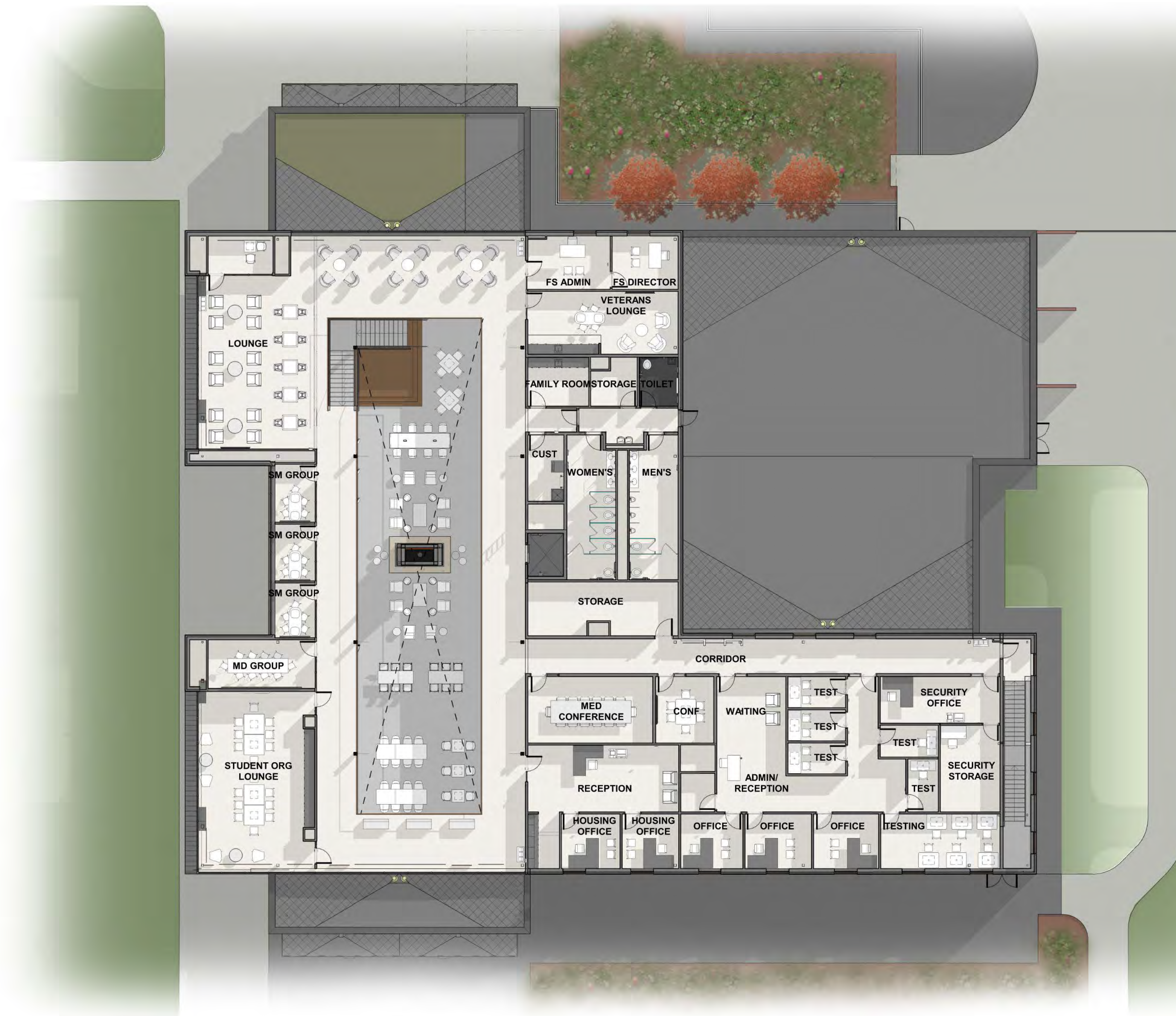
SECOND LEVEL - STUDENT CENTER