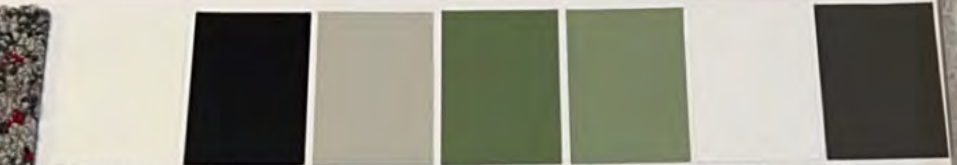
P-1/P-1A/P-1B P-2 P-3 P-4 P-5 P-6A/P-6B P-7