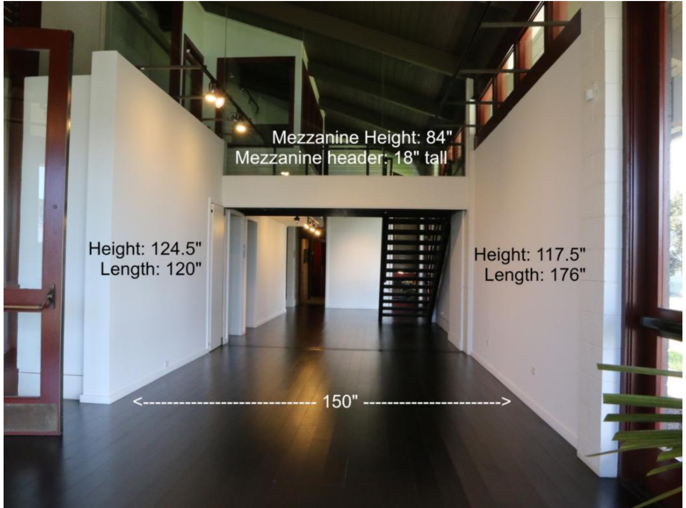
view from atrium / lobby entrance

Wall heights vary from 8 feet to 10 feet tall