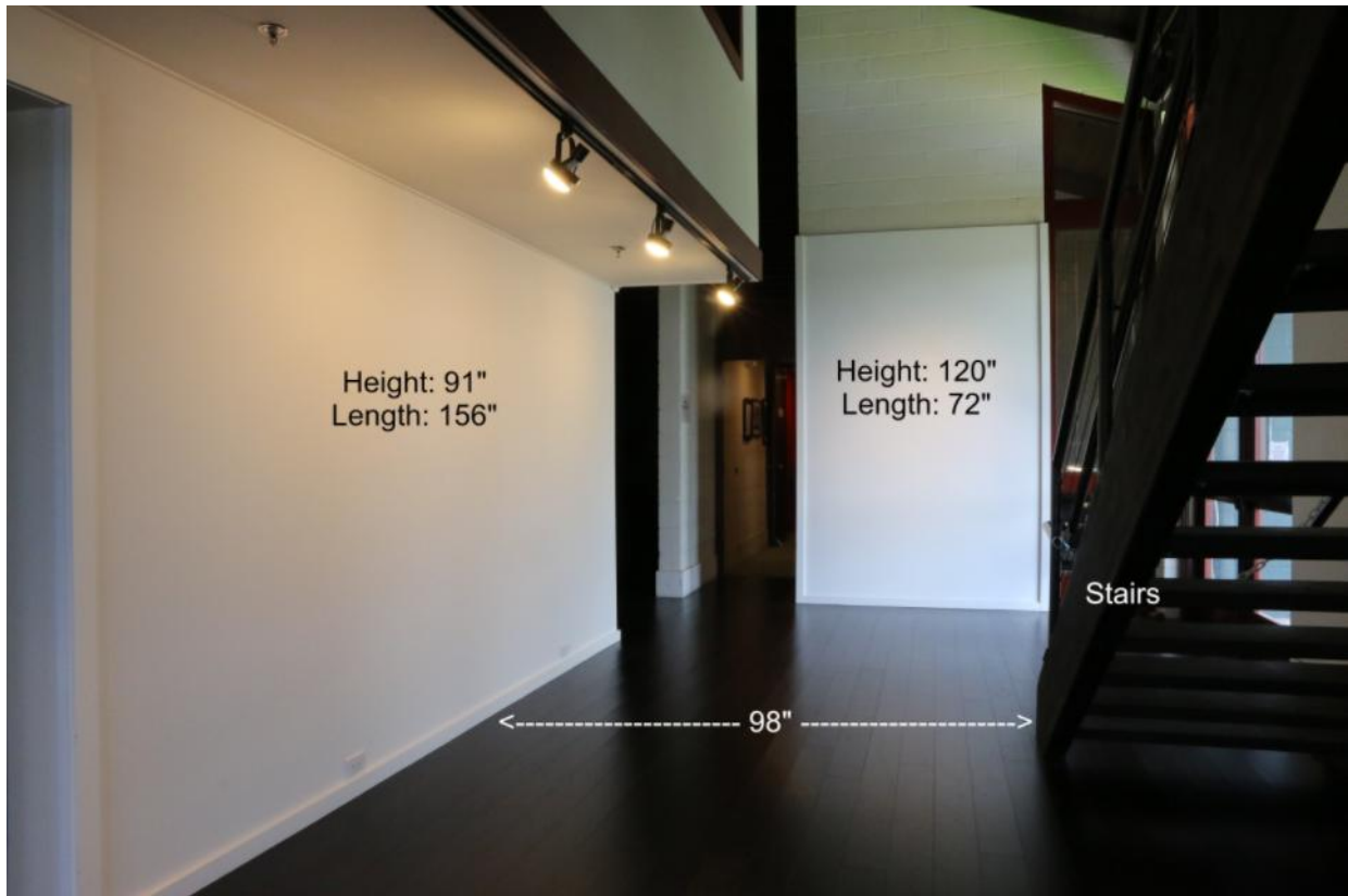
hallway adjacent to stairs