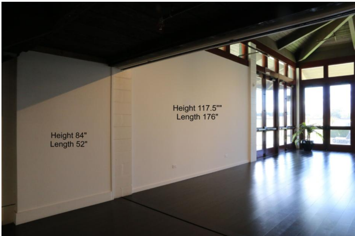
Under the Mezzanine looking back towards the Emergency Exit and atrium. Windows are UV protected.