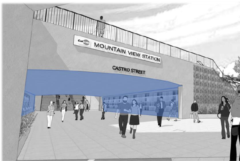
Figure 6: Castro Street—Main Undercrossing Wall Space

Castro Street Main Undercrossing—Available wall space, up to 10 segments, of 8' by 14' (the tunnel ceiling will not be usable for artwork).