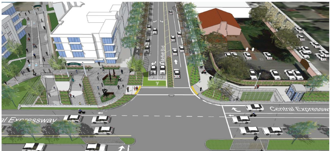
Figure 2: Rendering of North Side of Central Expressway

The bicycle/pedestrian underpass will connect the Moffett neighborhood with downtown via three undercrossings (Figures 2, 3, and 4):