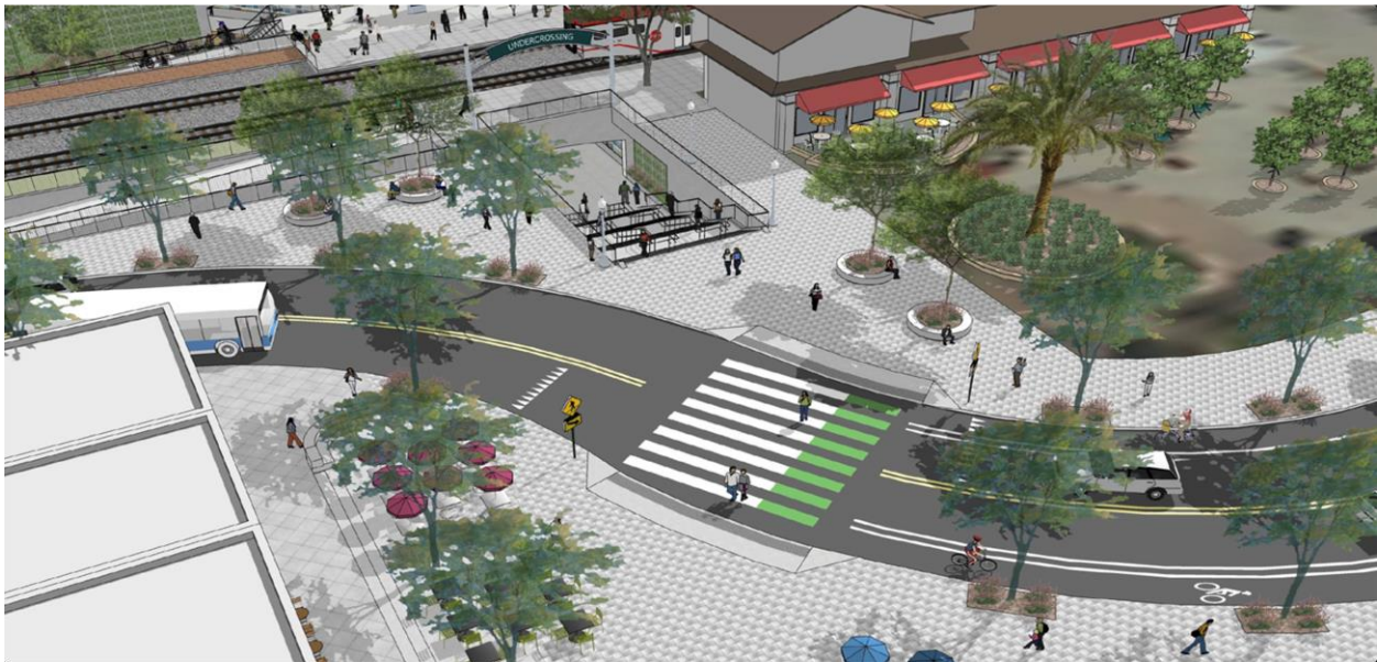
Figure 4: Rendering of the Evelyn Plaza