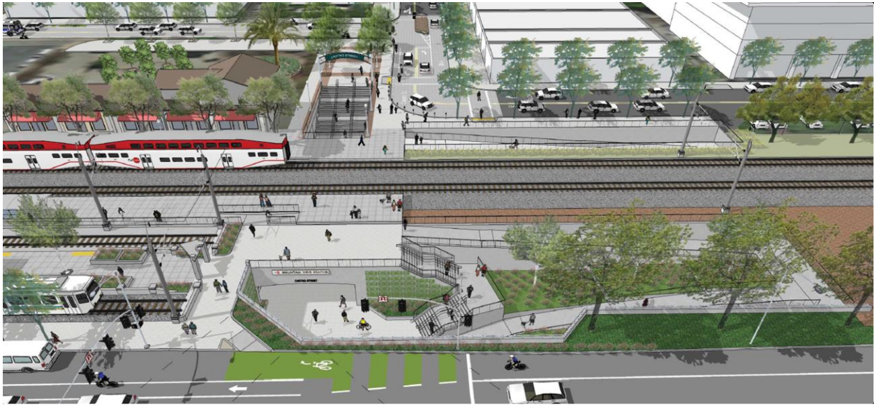
Figure 3: Rendering of South Side of Central Expressway