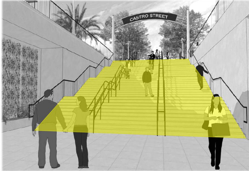
Figure 7: Castro Street Grand Staircase Leading to Downtown

Castro Street Stairway (Figure 7)—Width of staircase is 24'.