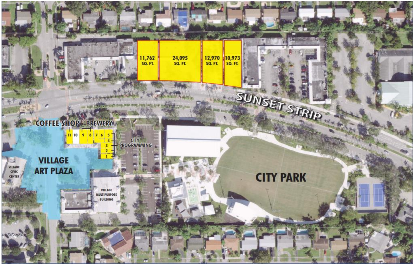
Future Art Plaza Area (highlighted in blue)