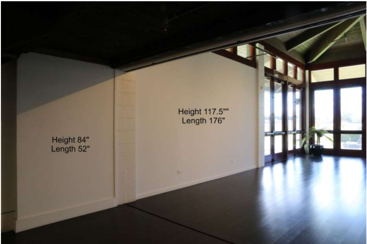
Under the Mezzanine looking back towards the Emergency Exit and atrium. Windows are UV protected.