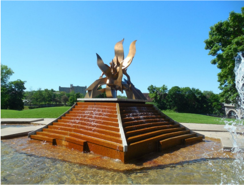
Spirit of Freedom Fountain by Richard Hunt

The Brush Creek Cultural Heritage Trail will be an extension of the Spirit of Freedom Fountain by Richard Hunt that was dedicated in 1981.