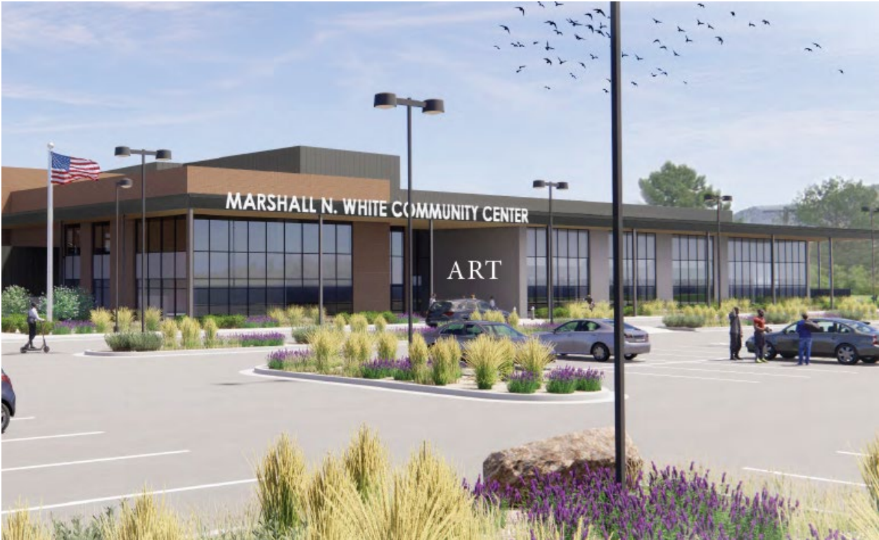
Outside Entry Wall Metal Sculpture (Brick surface) 25' wide by 16' tall