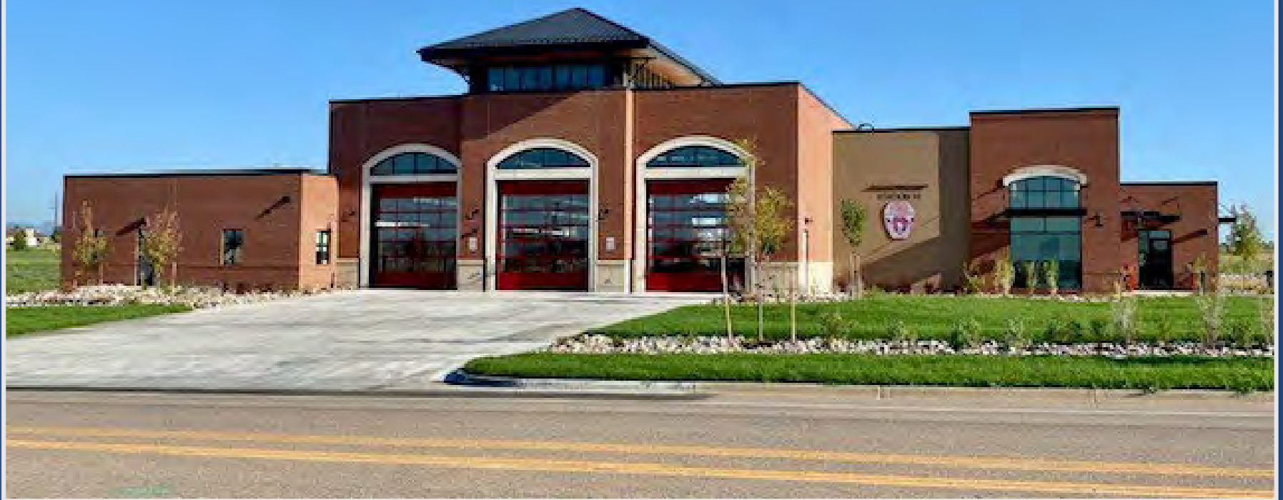
Fire Station 10 – 4301 Ronald Reagan Blvd. Opened October 2022