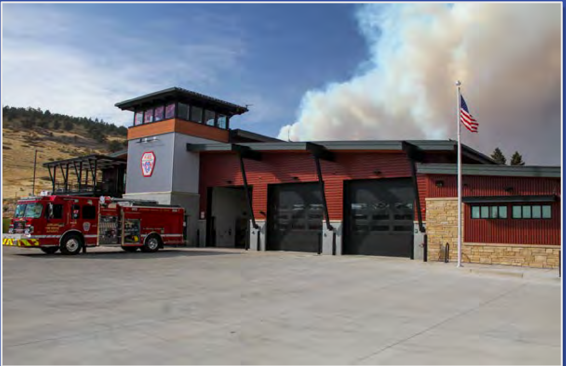
Fire Station 7 – 2629 North County Road 27 Opened April 2020