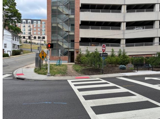
Ann Street Plaza