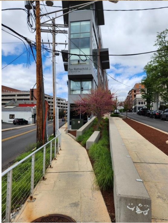
Market + Bank Point