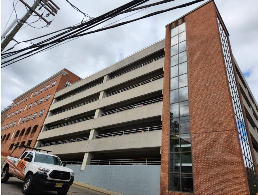
Ann Street Façade