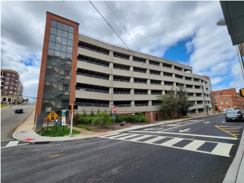
Bank Street Façade

The Ann + Bank Garage is a parking structure located at the corner of Ann + Bank Street. The first façade, located along Bank Street, is roughly 270 linear feet and has six levels. The second façade, located along Ann Street, is roughly 100 linear feet and has six levels.