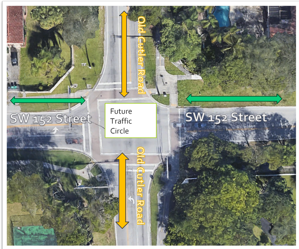
SW 152 Street and Old Cutler Traffic Circle