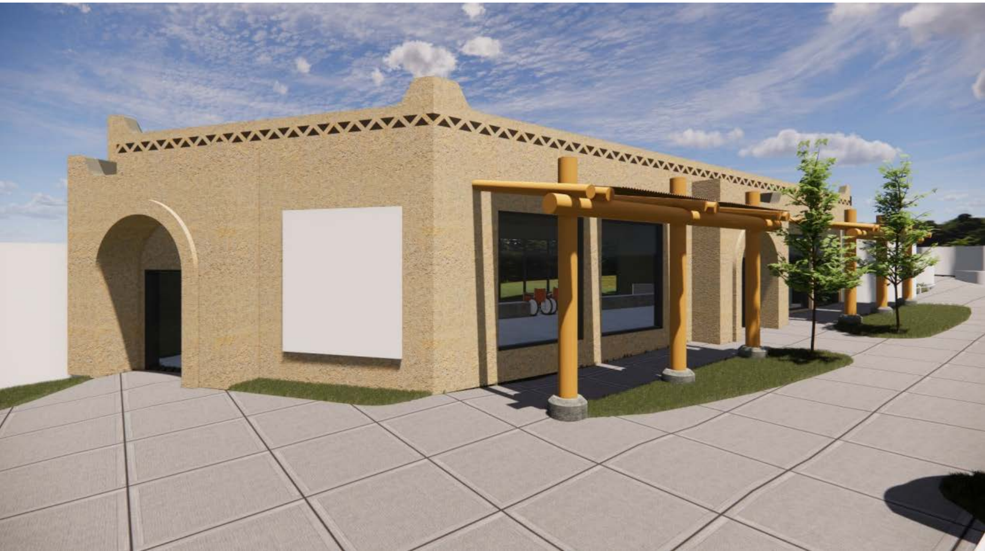
Renovated lion viewing building