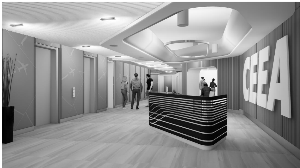
Figure 7: Level 4 lobby, elevator bank