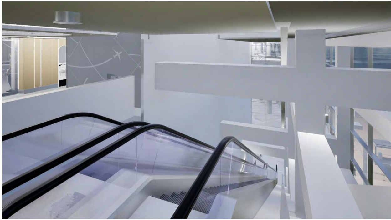
Figure 6: Level 4, looking towards level 1 of escalator space.