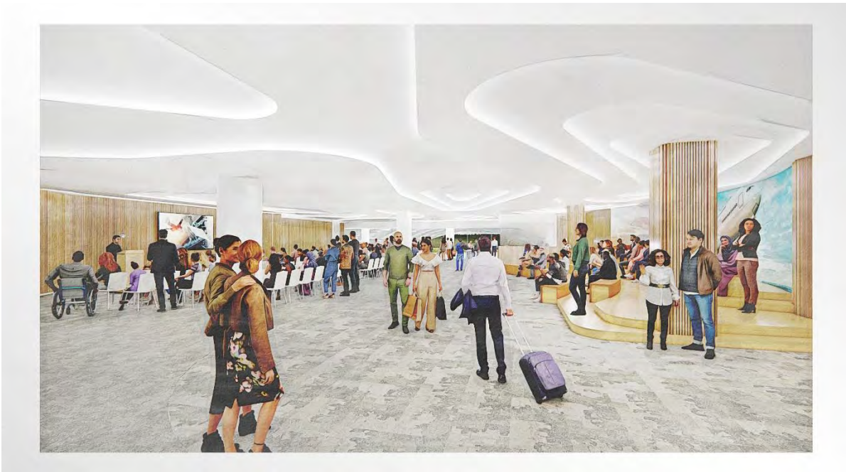
Figure 2: CEEA Rendering, Hall of Equity