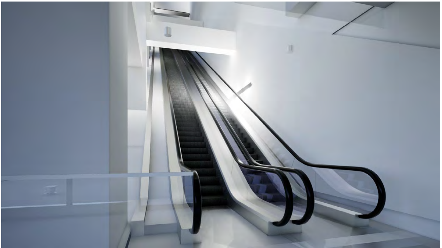
Figure 5: Level 1, looking up to level 4 in escalator space.