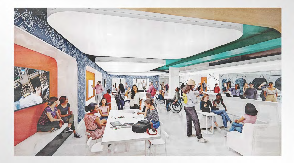
Figure 1: CEEA Rendering, Research & Innovation Lab