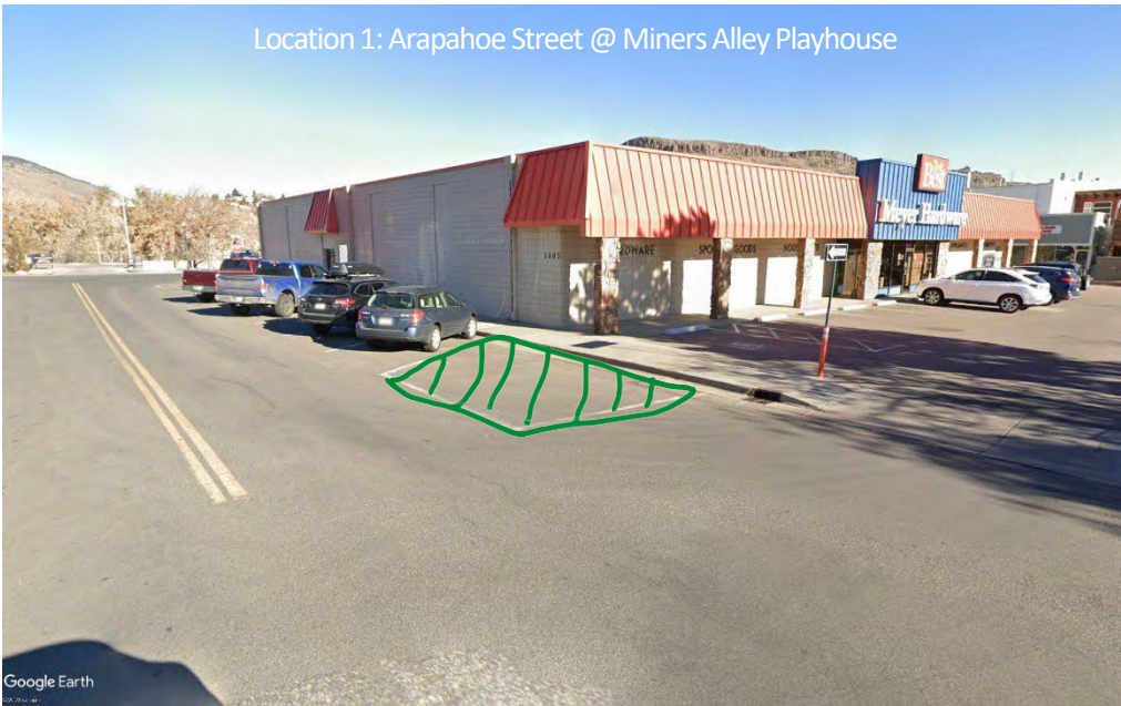
Location 1: Arapahoe Street @ Miners Alley Playhouse