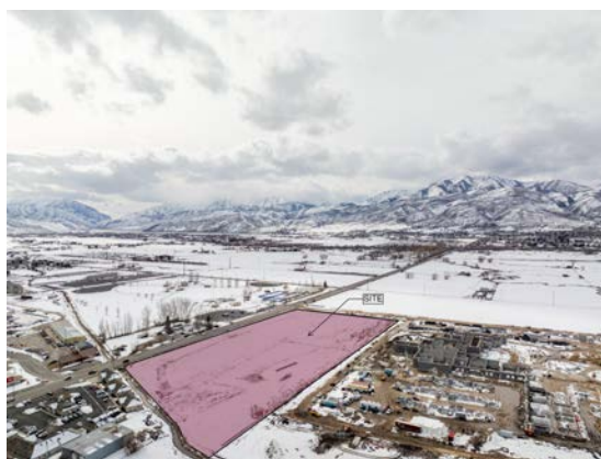
Drone Image of MTech Heber Building site location