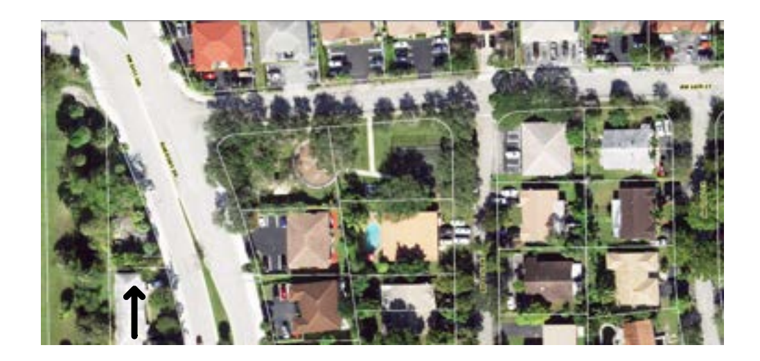
Aerial Facing South

The artwork will be located in Pride Promoters Park, which is a neighborhood park on Riverside Drive and NW 44<sup>th</sup> Court. The park is surrounded by multifamily and single family residences. It contains basketball courts, a pavilion with picnic tables, and a playground. The City will be completing upgrades to the basketball courts and playground to enhance accessibility features over the next year, which will compliment any art piece that will be located on site. It has beautiful tree coverage and is widely utilized by the surrounding community. Riverside Drive is an arterial road which has a considerable amount of pedestrian and vehicular traffic. There is a county bus stop located adjacent to the park on Riverside Drive. For more information on Pride Promotes Park, visit: https://www.coralsprings.gov/Parks-Directory/Pride-Promoters-Park