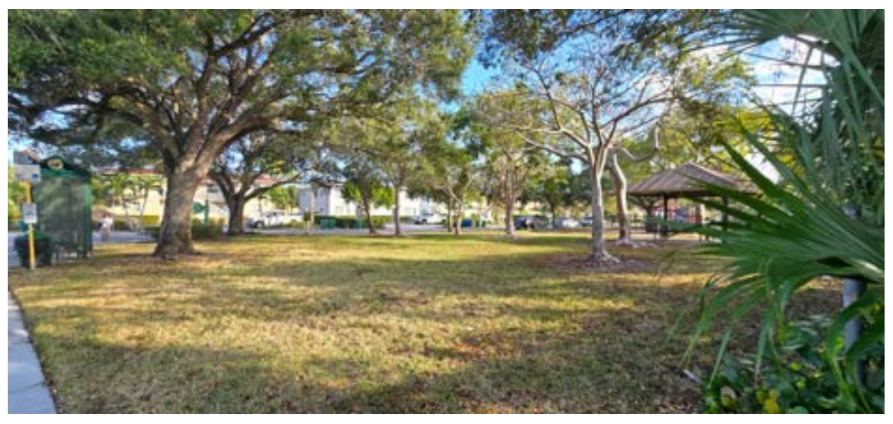
View from Northern edge of park, looking southwest