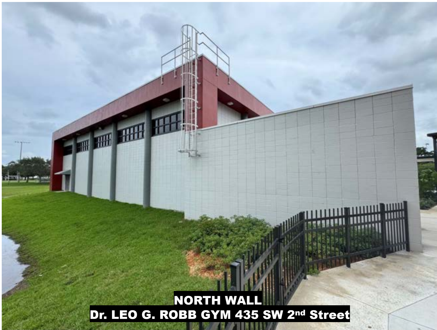
NORTH WALL Dr. LEO G. ROBB GYM 435 SW 2 nd Street