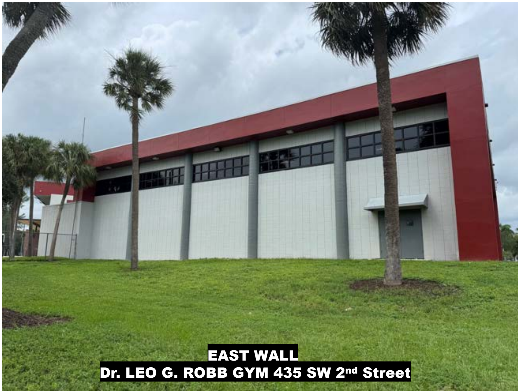
EAST WALL Dr. LEO G. ROBB GYM 435 SW 2 nd Street