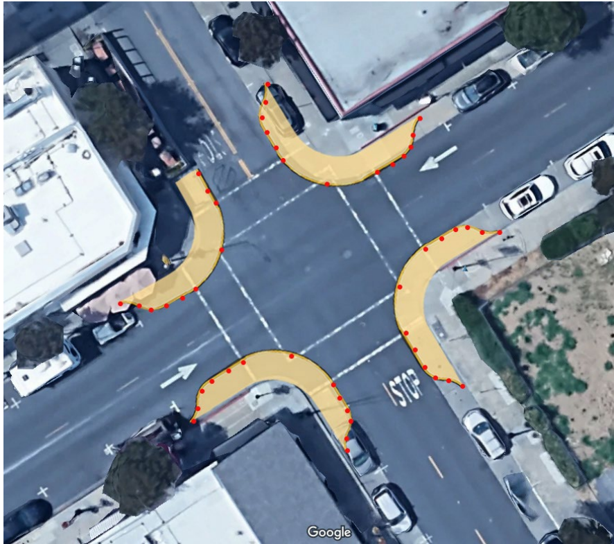
2 nd Street – Franklin Street