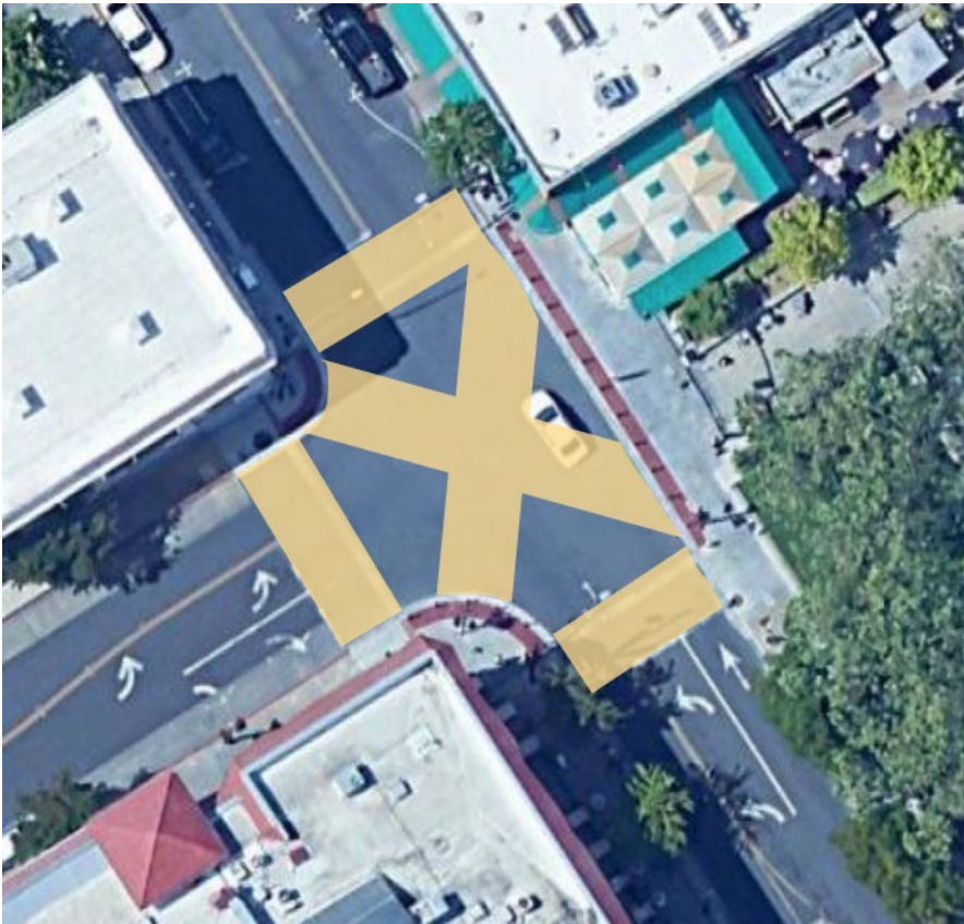
2 nd Street – Main Street (Pedestrian Scramble)