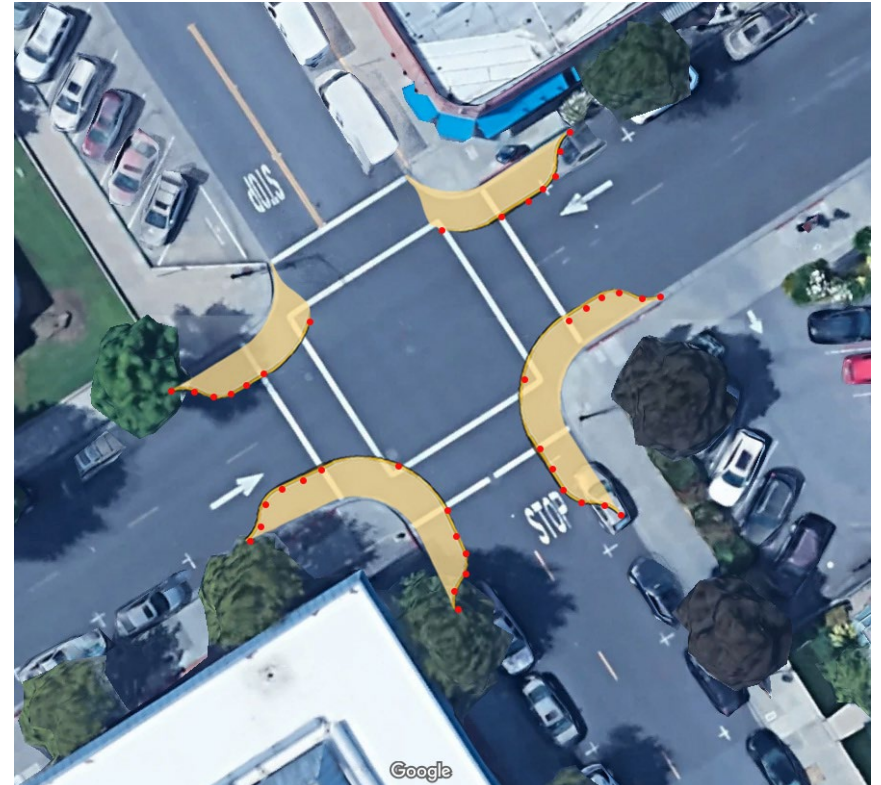
2 nd Street – School Street