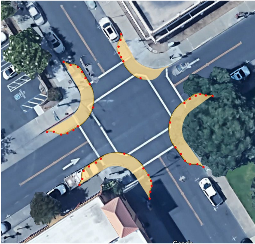
2 nd Street – Coombs Street