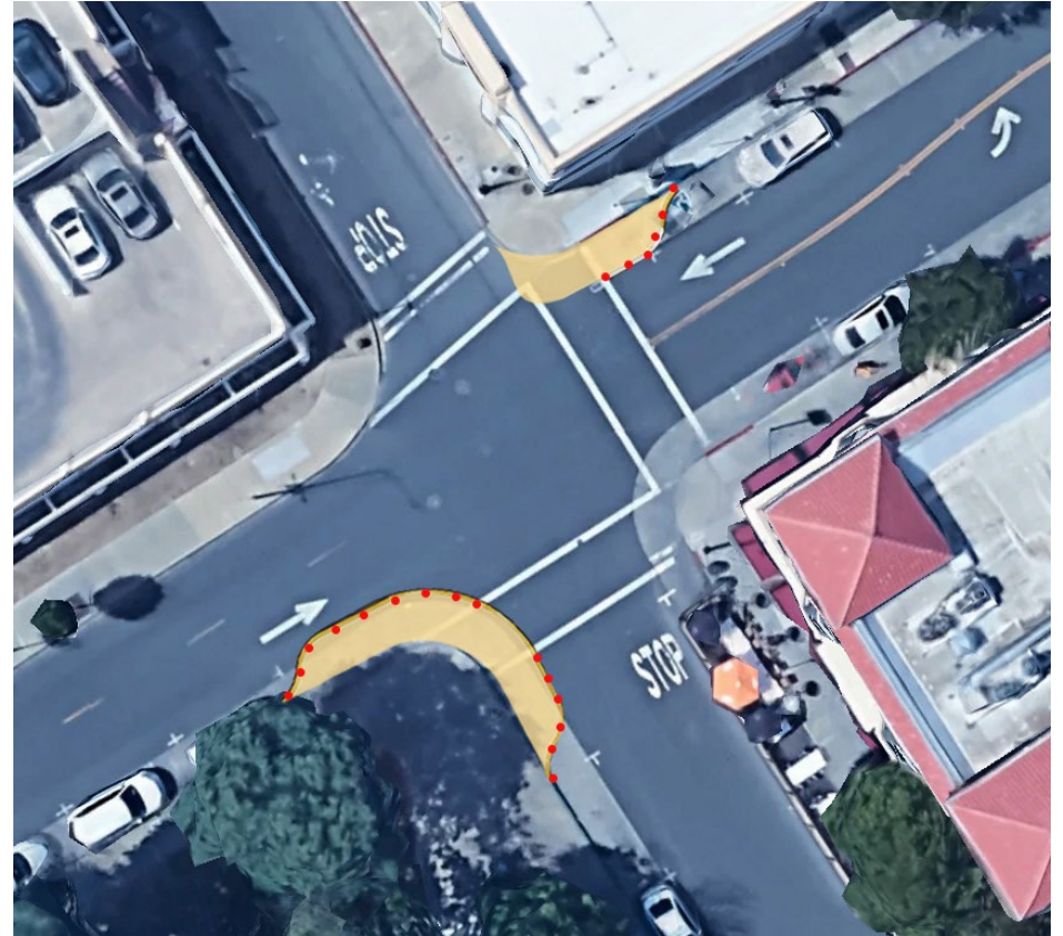
2 nd Street – Brown Street