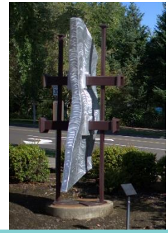
C Located in the garden area closest to Misty Dr.