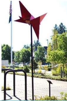
A Located between the bike racks adjacent to City Hall.