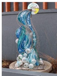
G Located outside the library near its entryway.