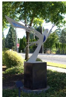
E Located on the corner of City Hall – visible from 162 nd Ave