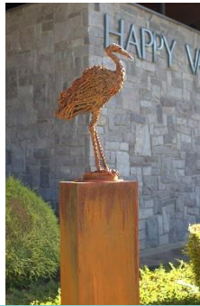
B Located right of entry stairs facing parking lot.