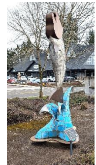
F Located at City Hall entrance sign/driveway.