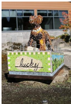
D Located in the garden area closest to Misty Dr.