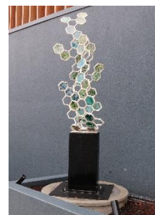
H Located outside the library by the multiuse rooms