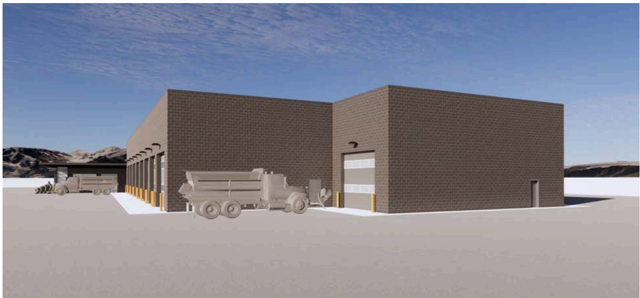
UDOT Maintenance Facility East View