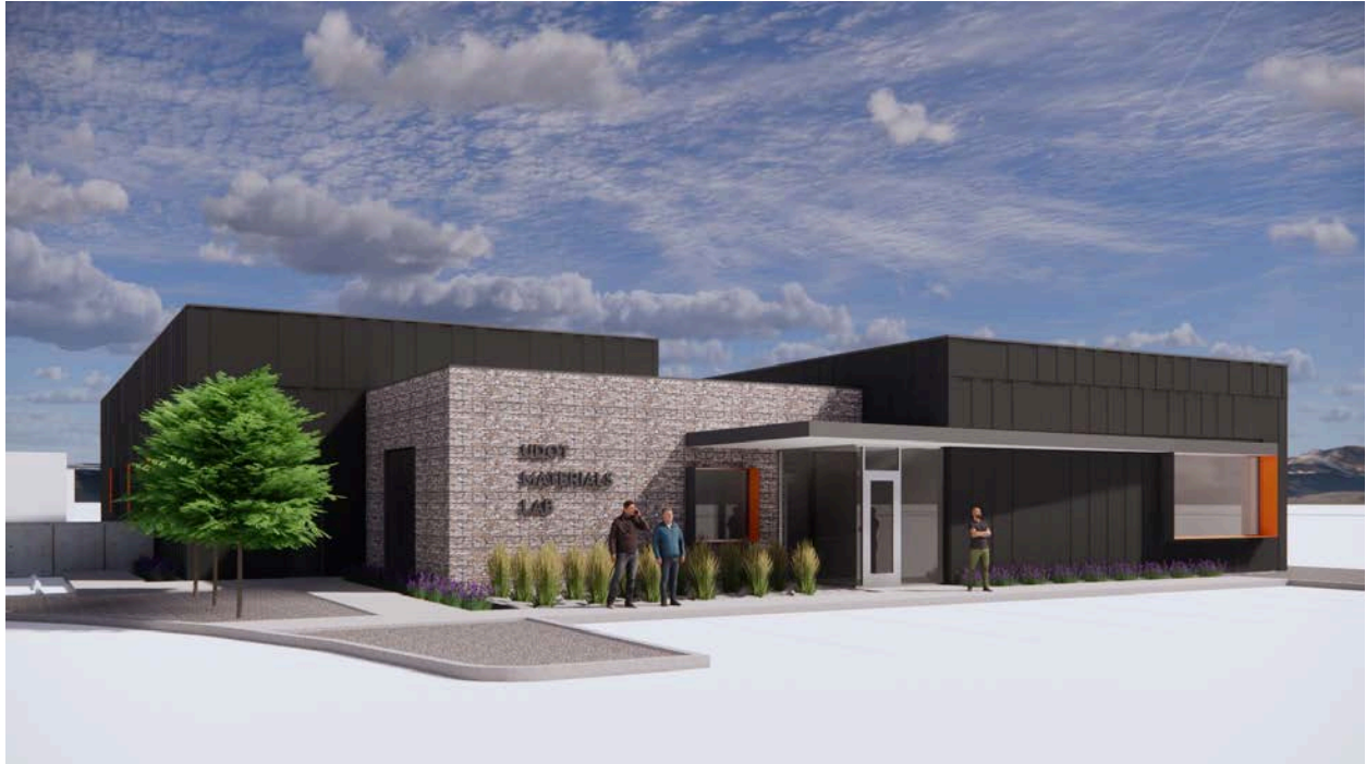
UDOT Materials Lab Southwest view