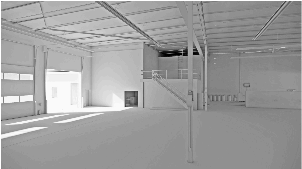
UDOT Maintenance Interior Bay 01