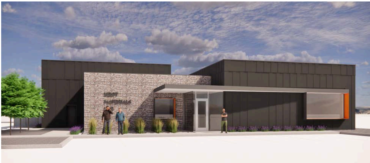
UDOT Materials Lab South View