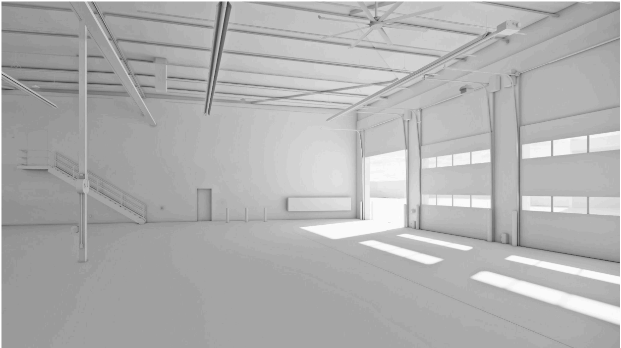
UDOT Maintenance Interior Bay 02