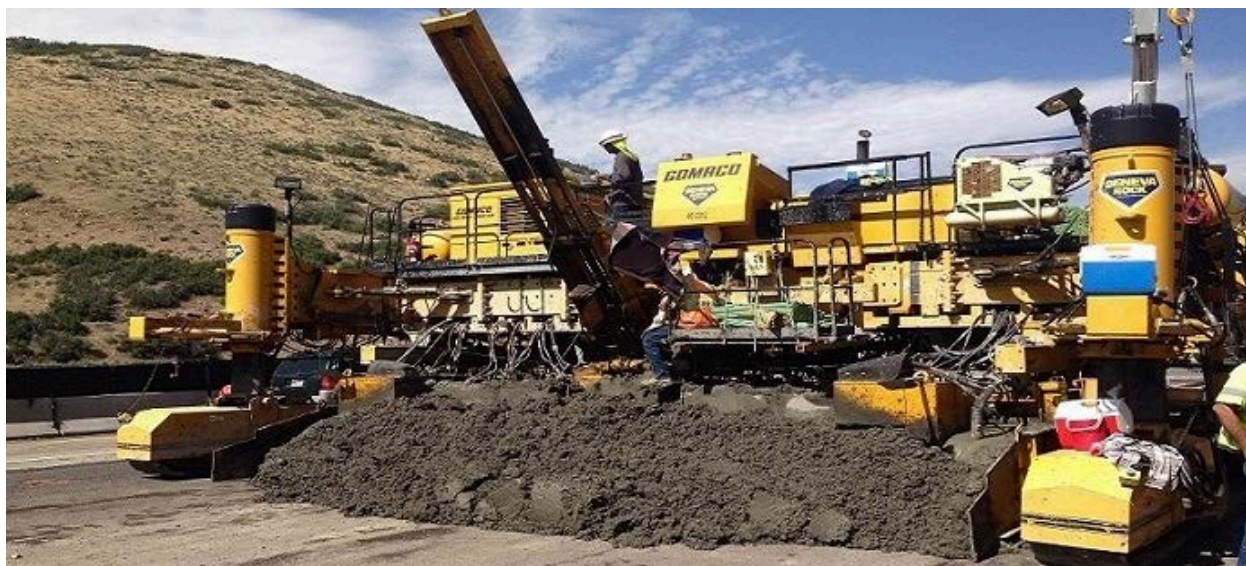
Text and Image Credited to Utah Department of Transportation

UDOT is recognized as a national leader in the transportation industry, and that is because of more than the condition of our roads and our innovative methods for operations, construction and project delivery. We believe that the way we do things matters and that our biggest successes come through our collective efforts as a team.