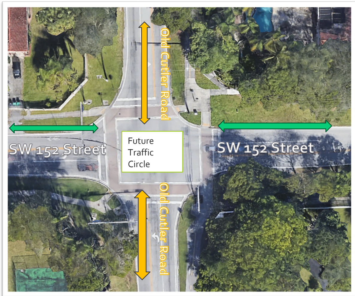
SW 152 Street and Old Cutler Traffic Circle