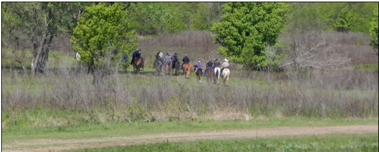
Pawnee Prairie Park