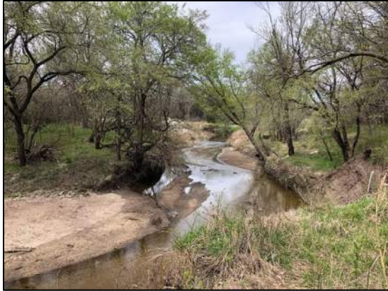
Pawnee Prairie Park