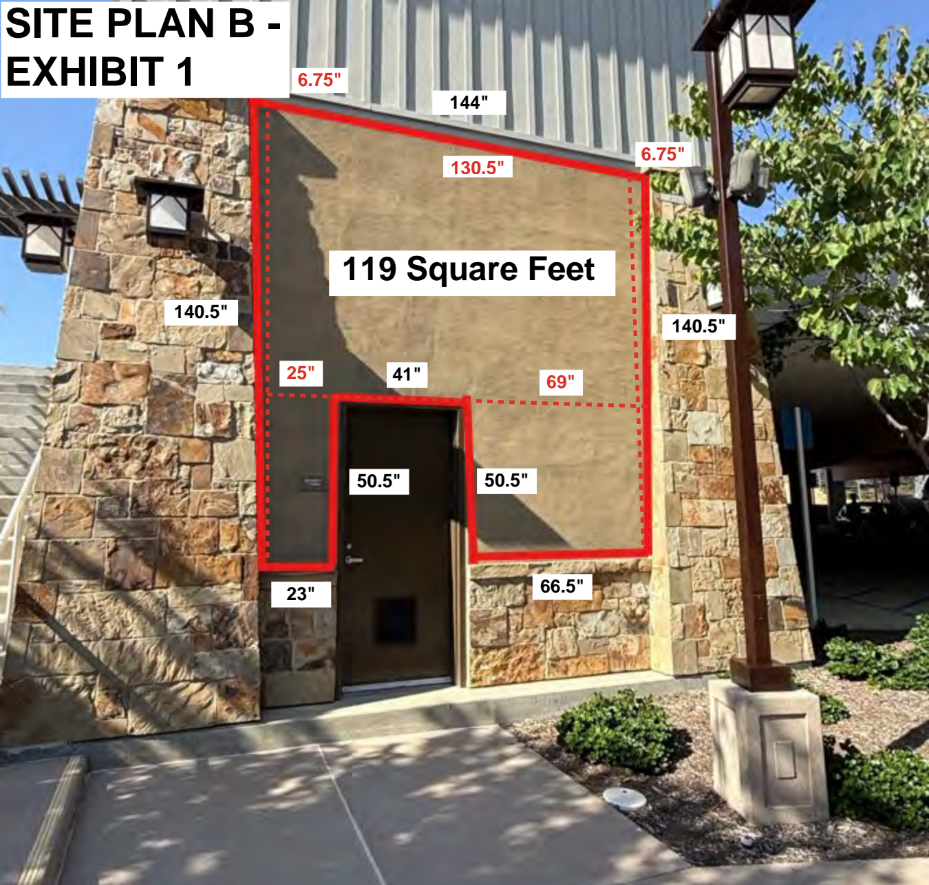
LF Civic Center Parking Structure Elevator Rear Wall (Stucco) 100 Civic Center Dr 92630