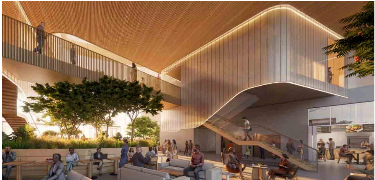
Convergence Hall interior rendering

“Where Innovation Converges to Solve Tomorrow’s Problems”