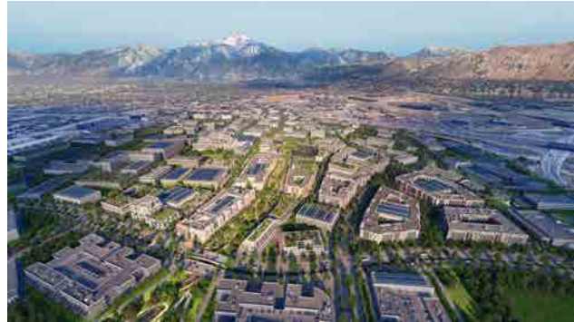
Proposal rendering for Phase I of The Point development.

Convergence Hall will be part of The Point Project, an urban development initiative converting 600 acres of state-owned land into a transformative Innovation Community. This area will be a unique mix of residential, retail, entertainment, civic, and commercial uses, including forward-thinking transportation approaches creating walkable and connected communities. The Point will be situated to provide access to the Jordan River Parkway trail and the Porter Rockwell Trail, in addition to numerous other parks and open spaces.