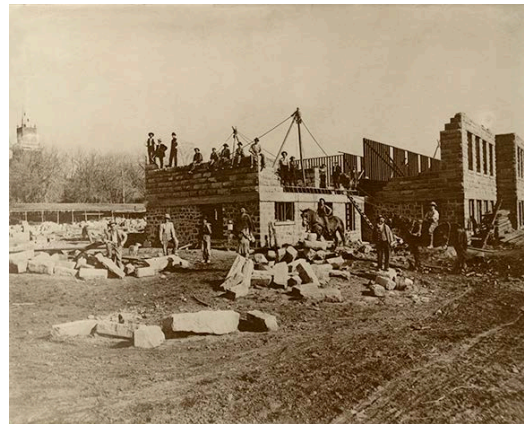
Construction of St. George Stake Academy in 1909.

In the late 1990s, Washington County residents appealed to the Utah Legislature, this time to petition for the addition of baccalaureate degrees to the college's associate programs. The college was granted approval to award bachelor's degrees in business administration and computer science. The college continued to add baccalaureate programs and, just two years after celebrating its centennial, gained university status in 2013. The University continues to grow and adopted a polytechnic approach to education starting in 2016 and master's degrees in 2018.