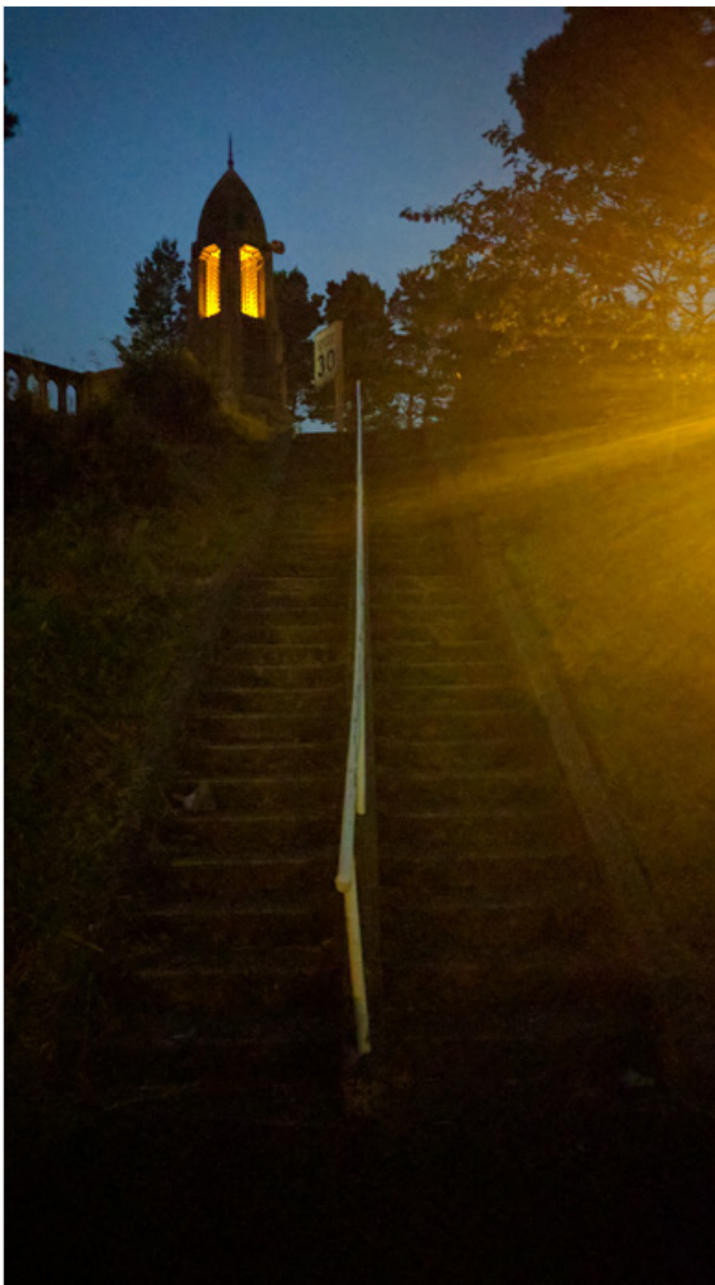
Night View of Steps from Bottom of Stairs.