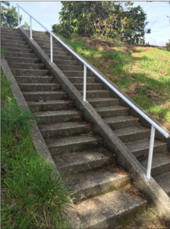
View of Bridge Steps from center landing, looking up to Highway 101.