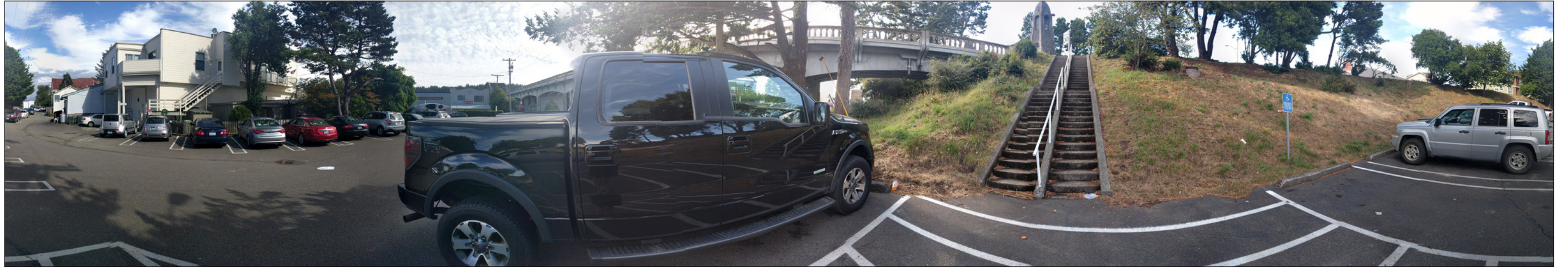
Panoramic View of the Steps from Parking Lot.