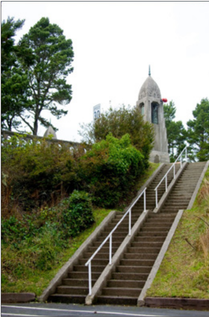
View of Bridge Steps from parking lot looking up to Highway 101 from right of Bridge Steps from Parking lot.