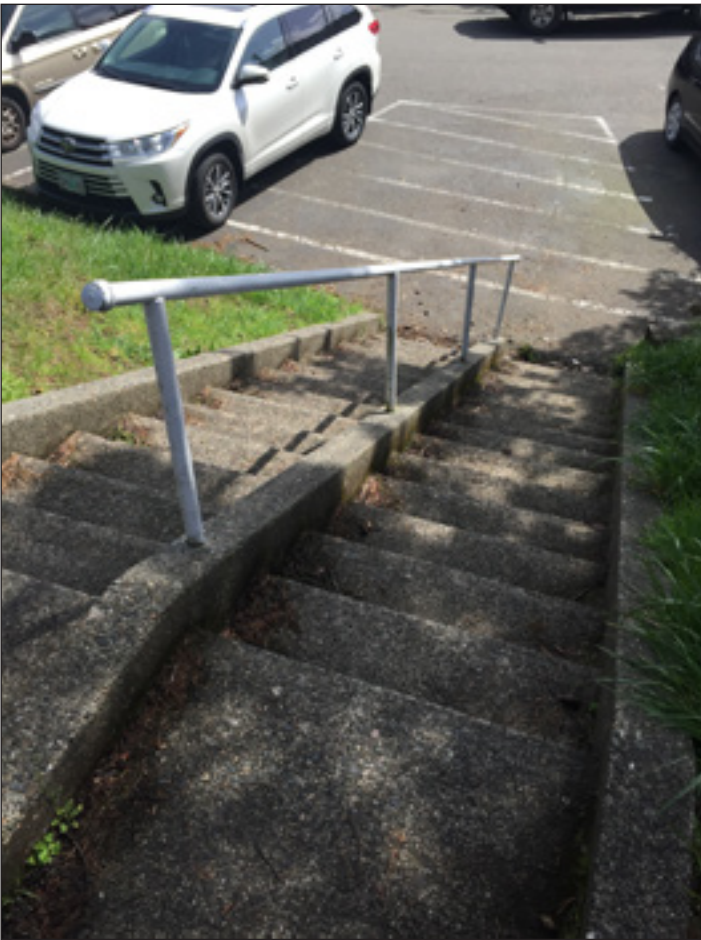
View of Bridge Steps from center landing, looking down to parking lot.