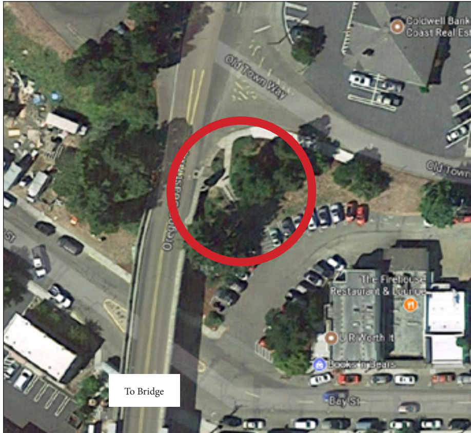
Birds Eye View of the Siuslaw Bridge Steps.