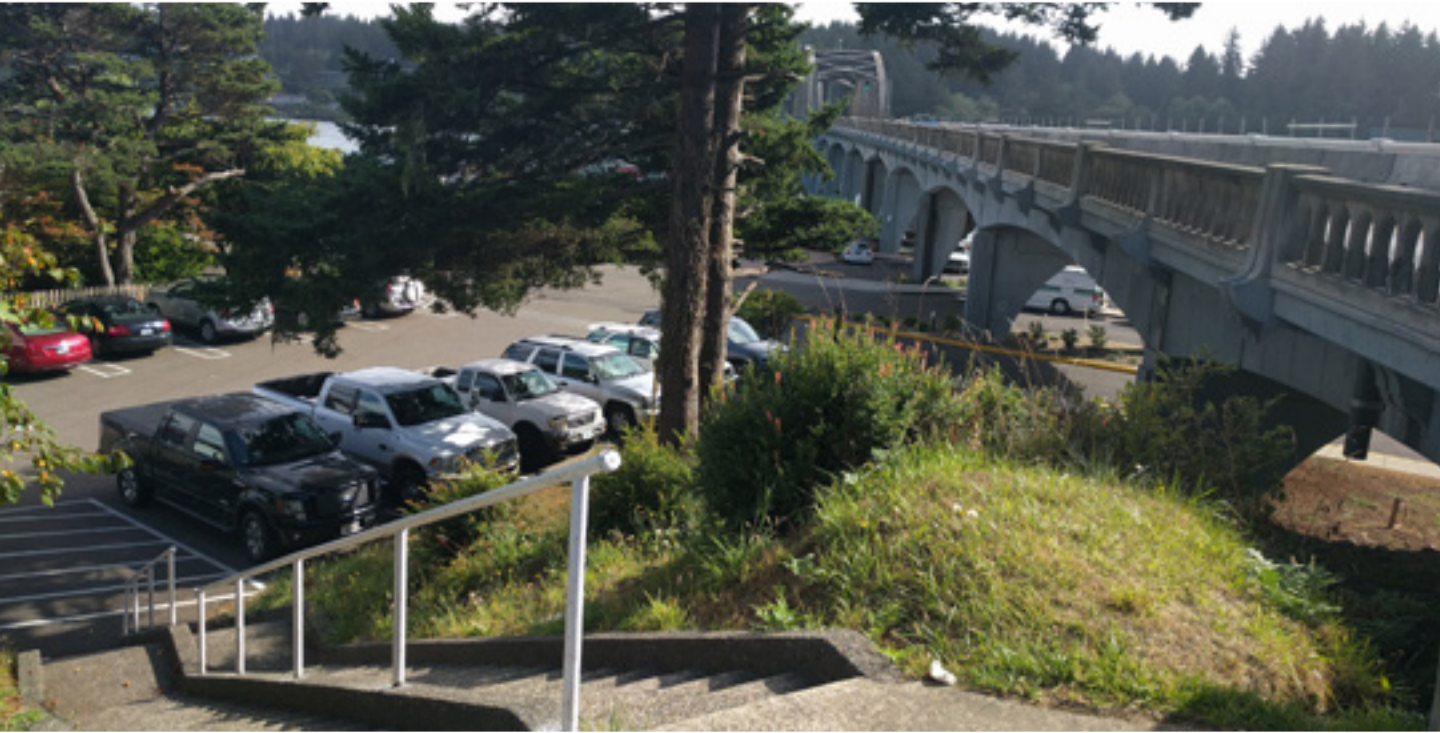
View of Bridge Steps from top landing, looking south to Bridge.