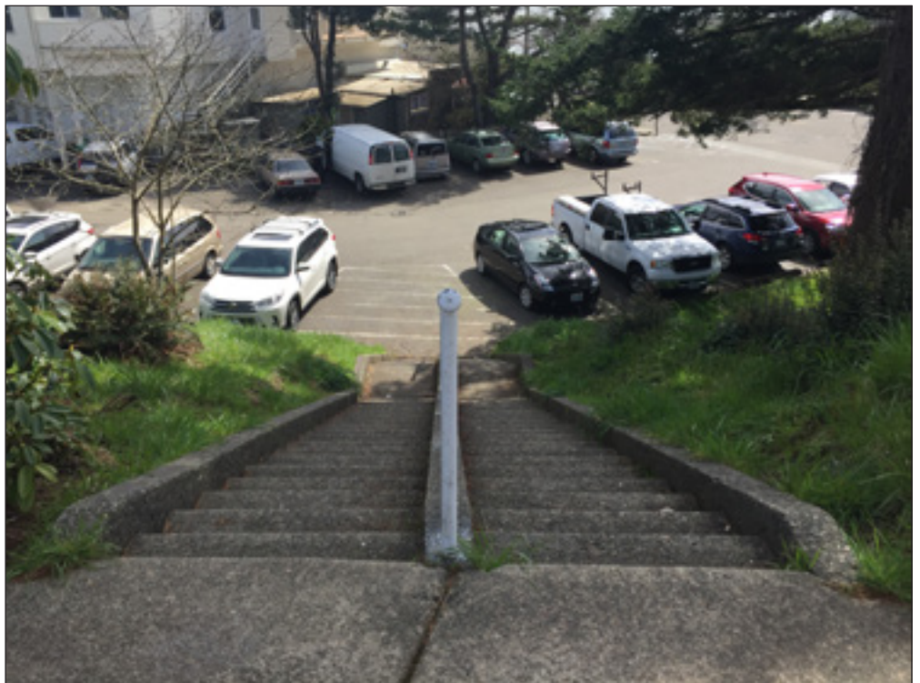
View of Bridge Steps from down steps from Highway 101 to parking lot.