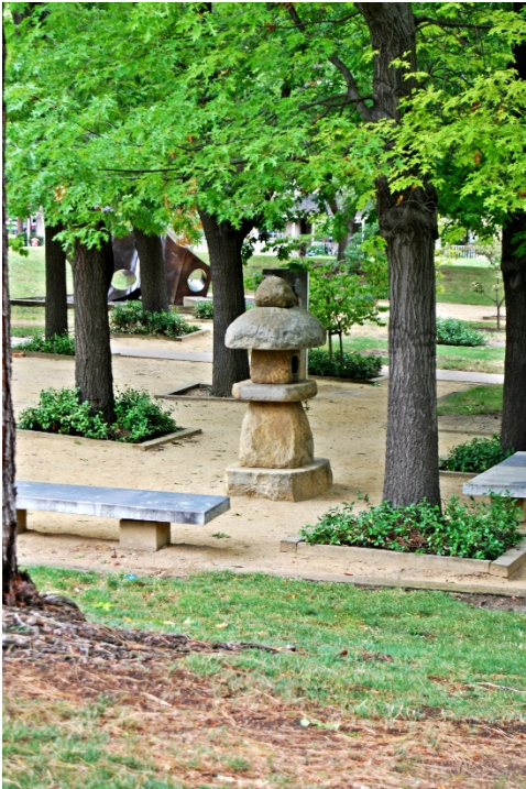
Japanese Lantern (Artwork #1)