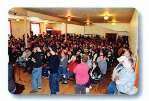
Rally at John Day Oregon