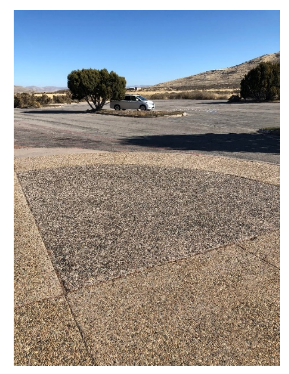
View of potential site from Visitor's Center's entrance