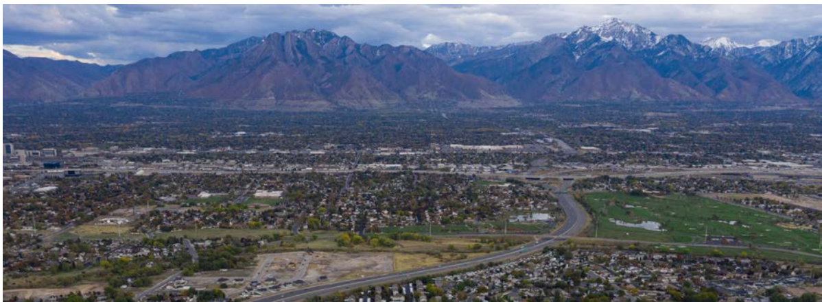
The City of Taylorsville