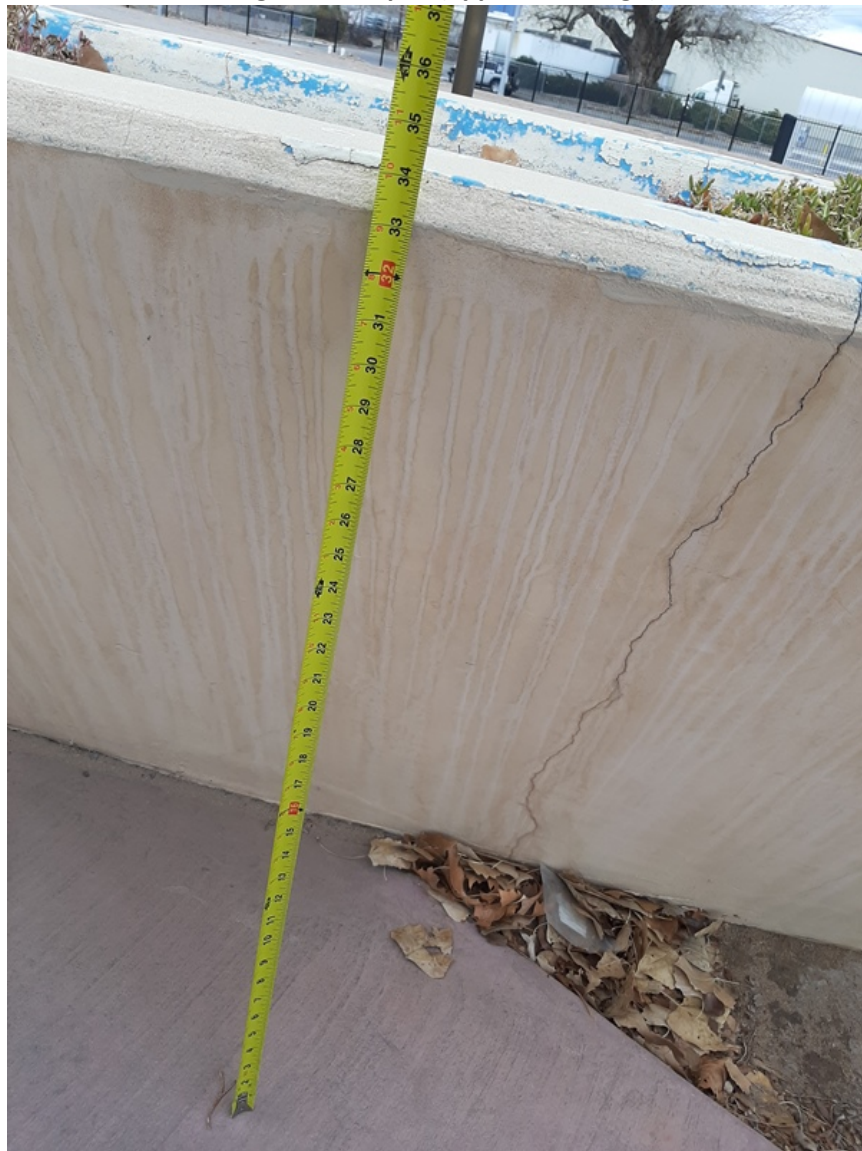
Measurement of height of Acequia (approx. 34" high)