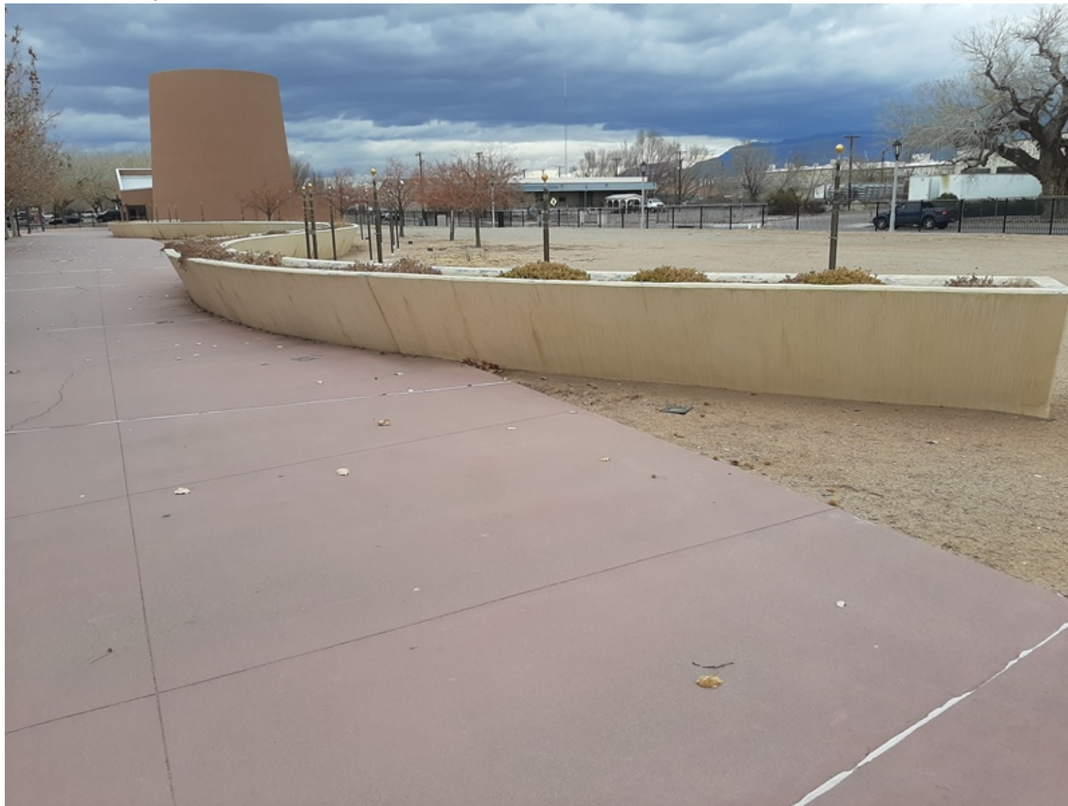
South end of Acequia Paseo