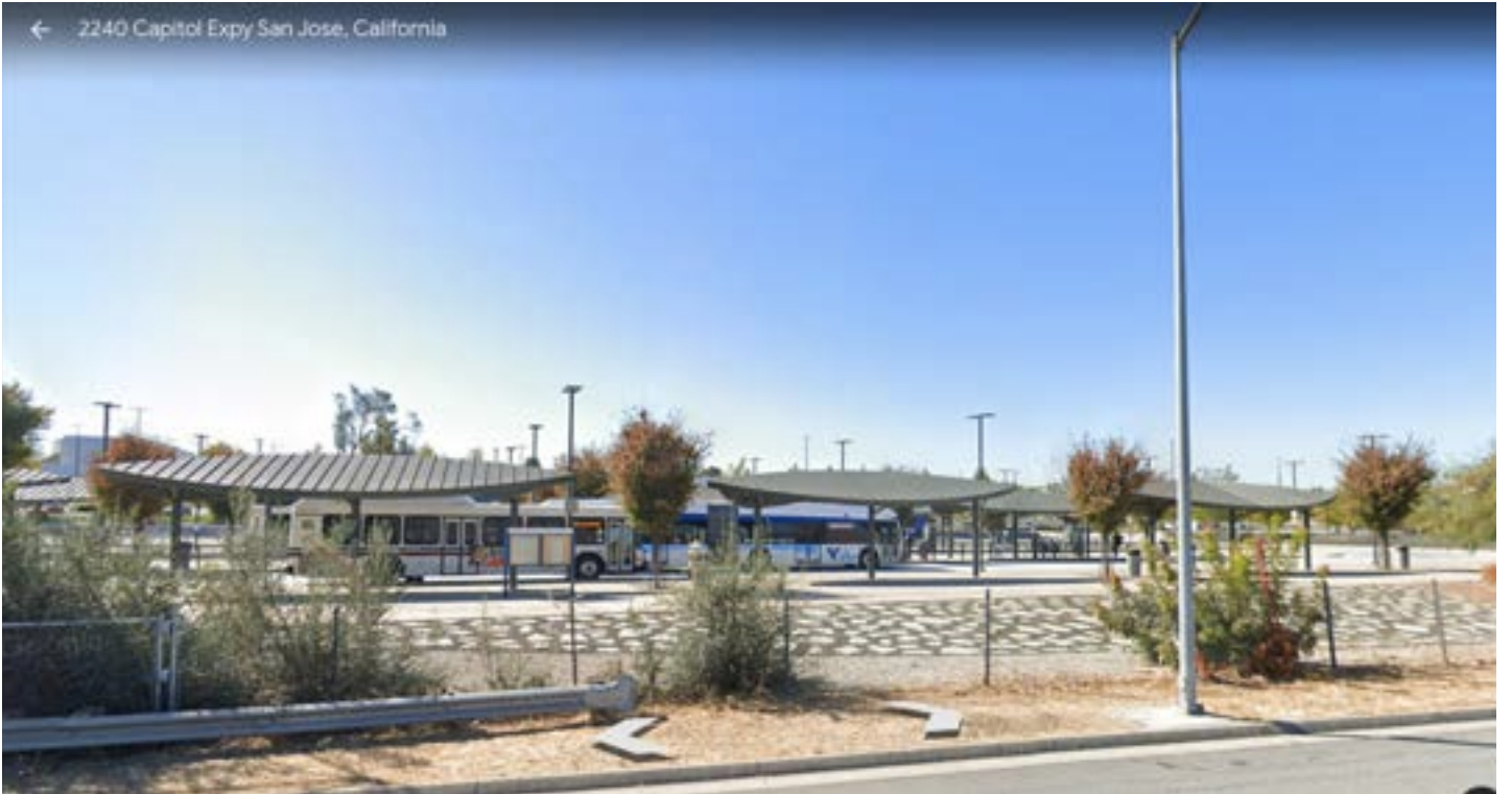
Street View Eastridge Station from East Capitol Expy (existing view of bus shelters)