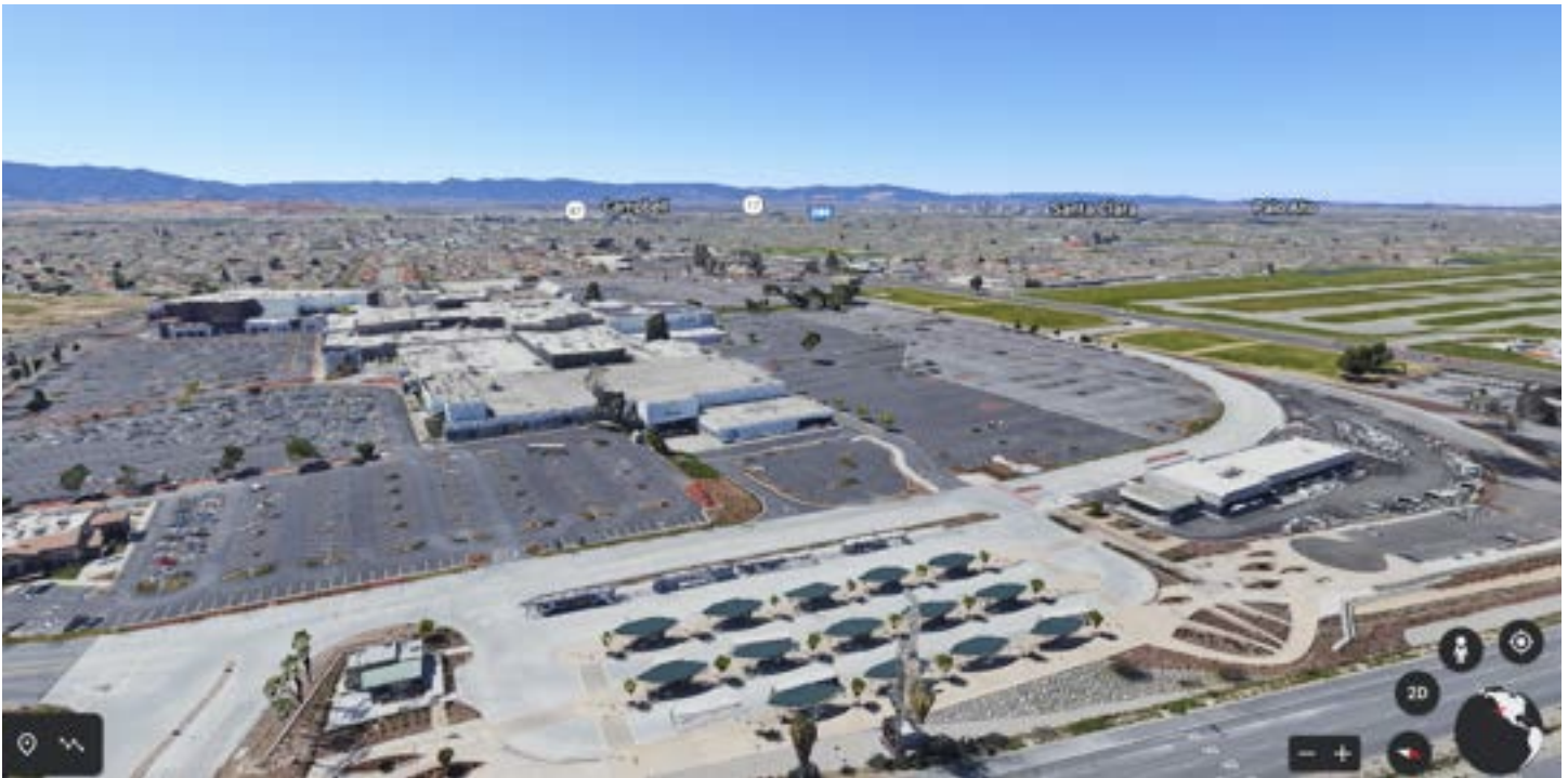
Aerial view Eastridge Station (existing view looking west towards Mall)