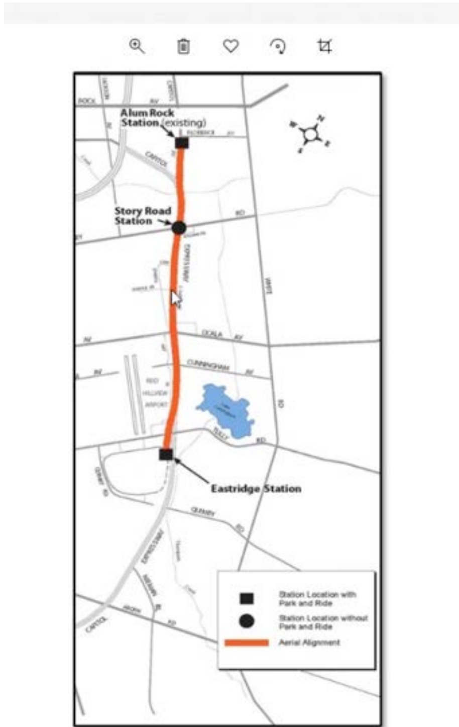
Context: Story Road and Eastridge Stations connecting to existing Alum Rock Station