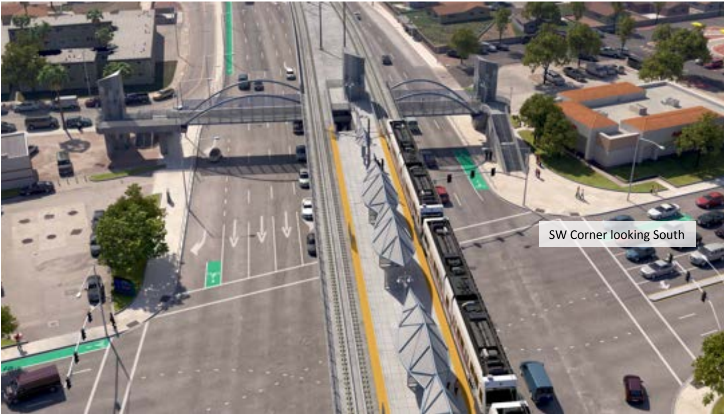
SW Corner looking South