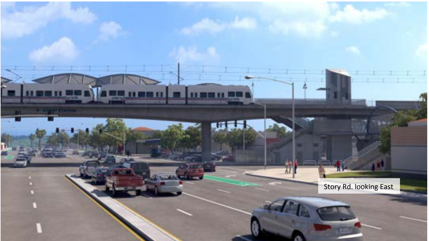
Story Rd. looking East