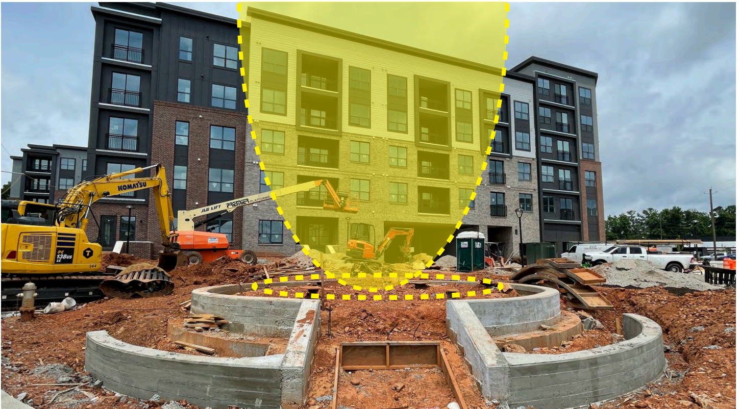
Looking Northwest (toward Notion apartments) from East Ponce de Leon Avenue entrance to shopping