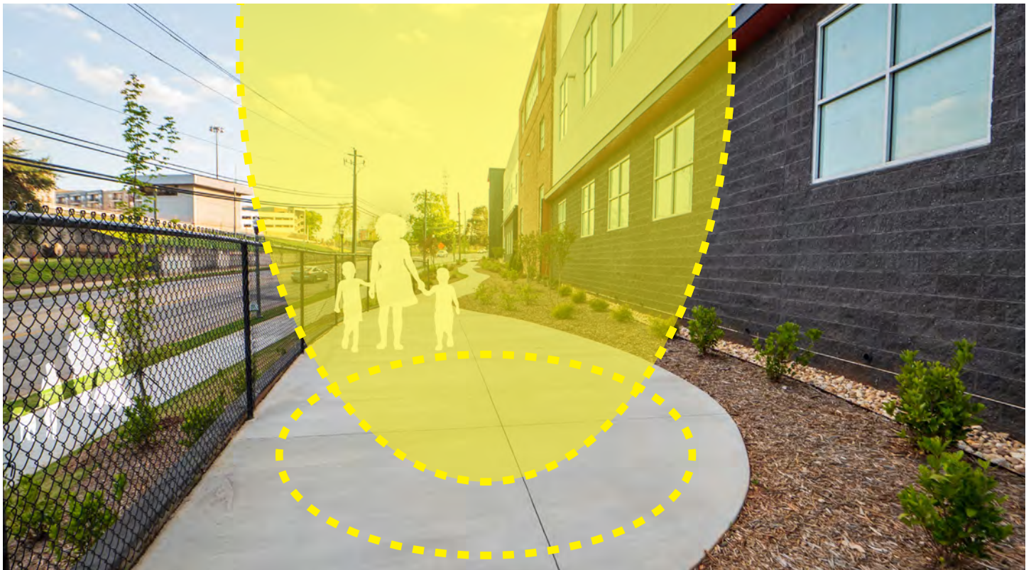
Looking West / Site A From Upper Walkway