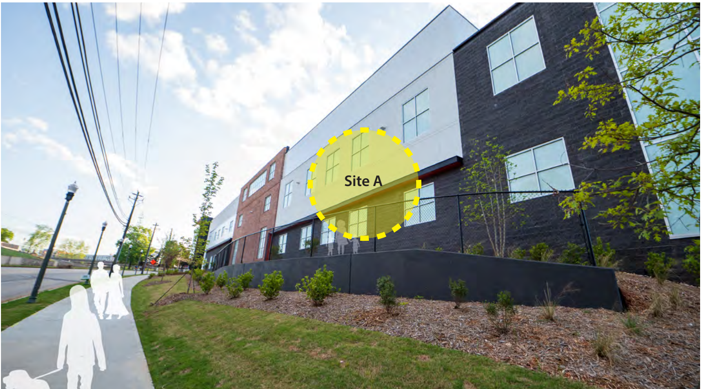
Looking West / Site A From Sidewalk