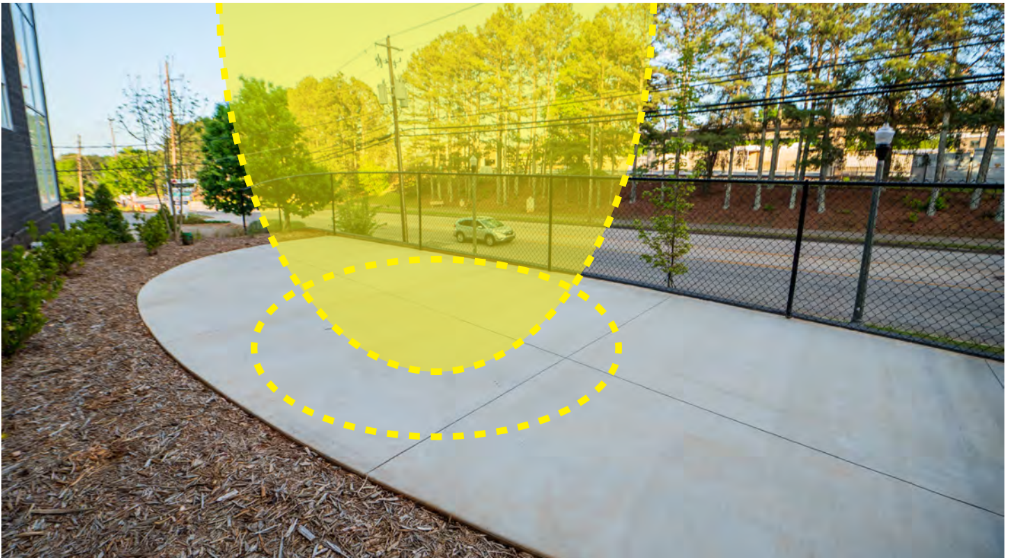
Looking Southeast From Upper Walkway