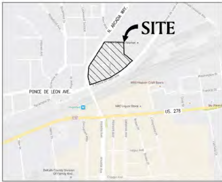
VICINITY MAP DECATUR, GA SCALE: NTS