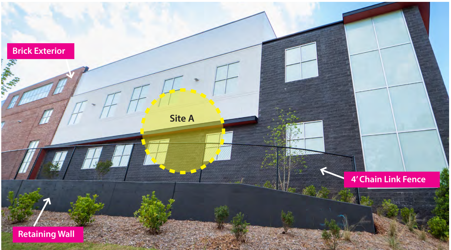
Looking North / Site A From East Ponce de Leon Avenue Sidewalk