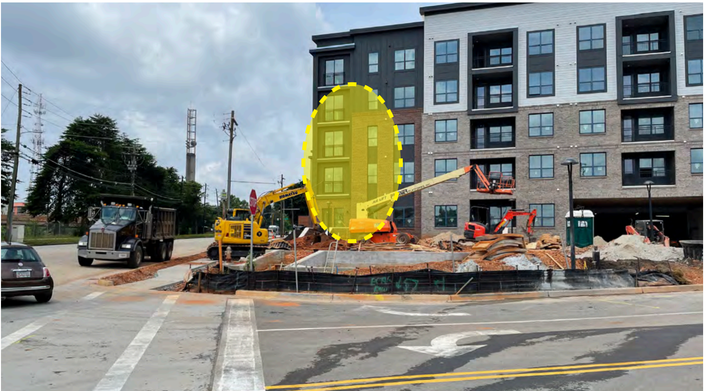
Looking West / Site B From Sidewalk